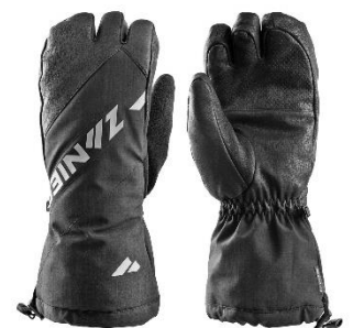
ALPINE PRO GRIP.GTX