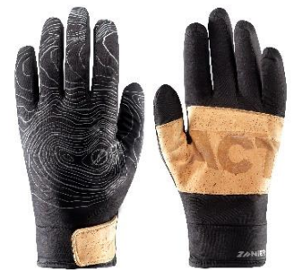
BLEED X ZANIER

Vegan, climate neutral, recycled and recyclable - an outdoor glove as a sustainability statement. All materials of the BLEED X ZANIER are vegan and highly functional, the synthetic materials are also bluesign® and oeko-tex® certified. Made of Sympatex®, Polartec® fleece lining and robust cork material with the matching laser print "ACT NOW". The stylish print on the backhand is water-based.