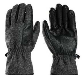
AUSTRIAN LODEN GLOVE

The AUSTRIAN LODEN GLOVE represents the heritage of Zanier Gloves. Original Austrian loden in combination with goatskin for the palm and touch function for operating the mobile phone. That's all an elegant outdoor glove needs to do to perform just as well on the alpine hut as in the city.